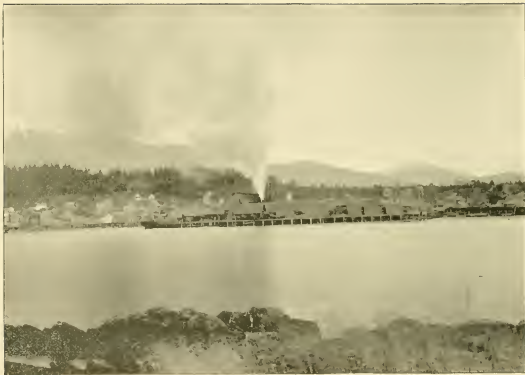
Fort Wrangel Saw Mills.